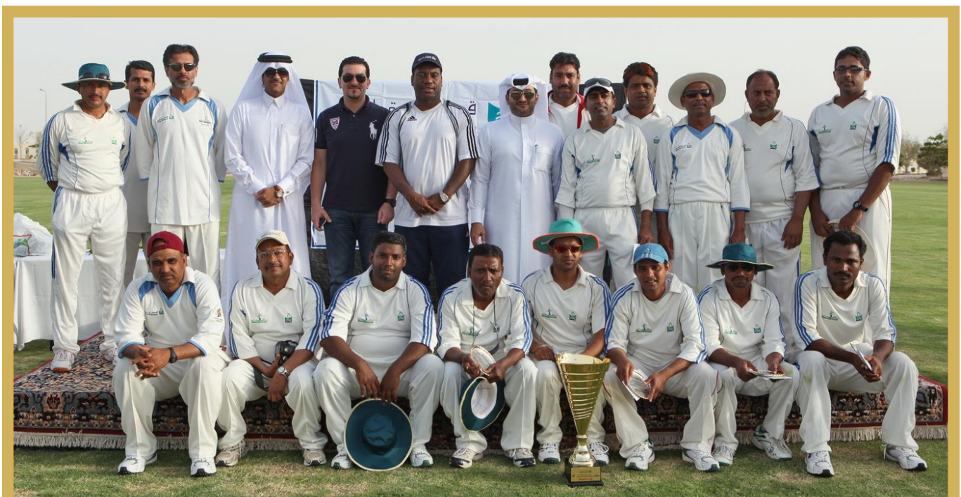
DKN Operations team runner-up of 8th Chairman's Cup Cricket Tournament – 2012