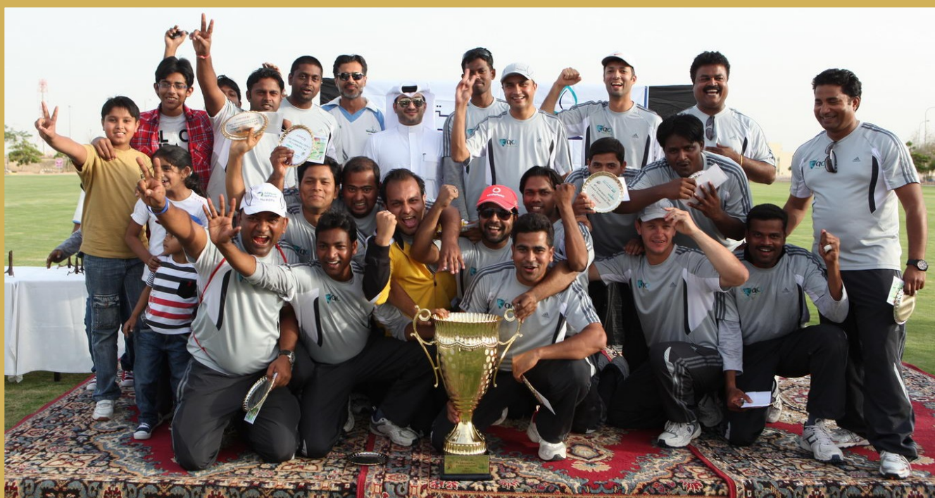
Mabrook! to Qatalum team for being crowned the Champion of 8th Chairman's Cup Cricket Tournament – 2012 in their debut appearance.

Several weeks of preparation and hard work went in the final match between DKN Operations vs Qatalum held on 14 th April 2012. DKN Operations team was considered hot